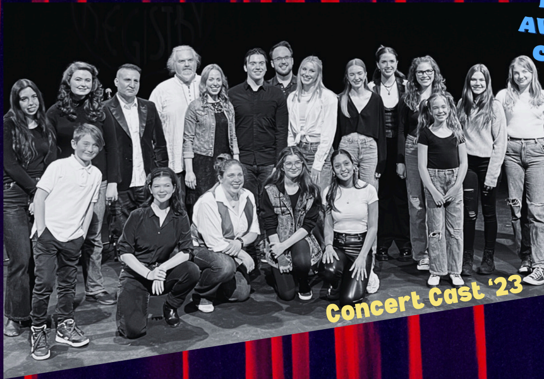
Concert Cast '23

A HILARIOUS CONCERT FOR AN AWESOME CAUSE!